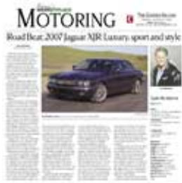
Autos for Sale

show as part of their ongoing Make a Difference Today partnership with officials from Habitat for Humanity International.